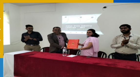
World Student's Day Drone Introductory Seminar 14th Oct, 2022