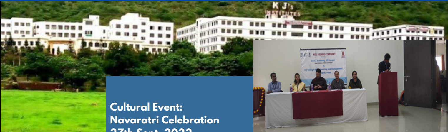
Cultural Event: Navaratri Celebration 27th Sept, 2022