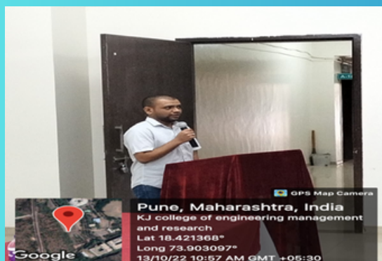
Pune, Maharashtra, India KJ college of engineering management and research Lat 18.421368° Long 73.903097° 13/10/22 10:57 AM GMT +05:30