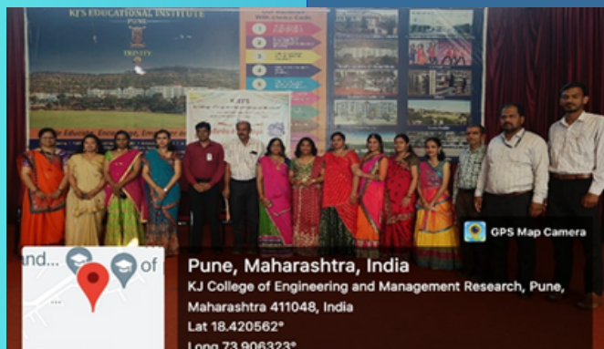
Pune, Maharashtra, India KJ College of Engineering and Management Research, Pune, Maharashtra 411048, India Lat 18.420562° Long 73.906323°