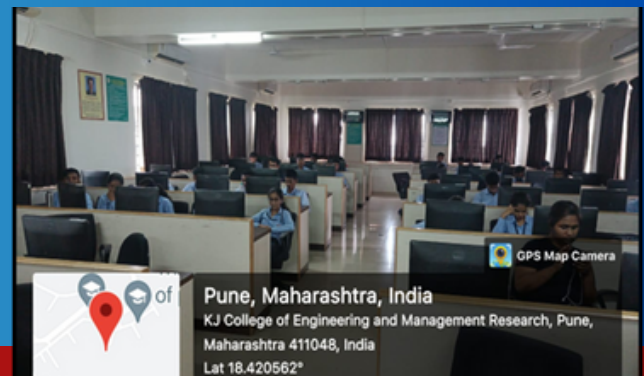
SDP on Introduction to IOT 26th-30th Sept, 2022