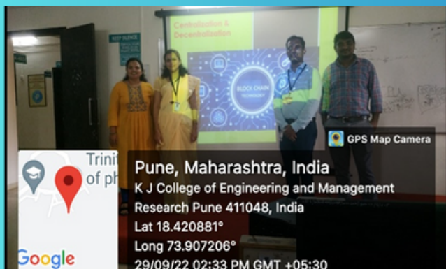
Pune, Maharashtra, India KJ College of Engineering and Management Research Pune 411048, India Lat 18.420881° Long 73.907206° 29/09/22 02:33 PM GMT +05:30