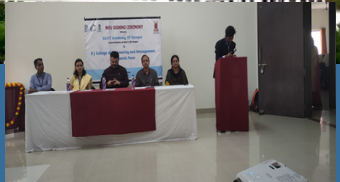
Membership Signing Ceremony IITK 29th Sept, 2022